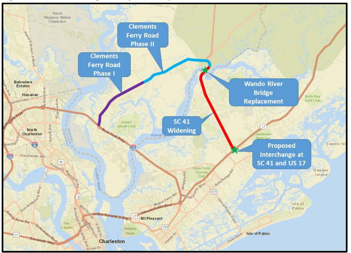
Figure 2: SC 41 Widening and Adjacent Projects