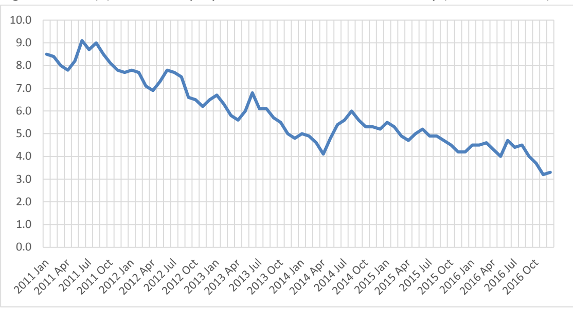
Figure 3: Five (5) Year Unemployment Rate for Charleston County

The low unemployment rate is shown in Figure 4 above is evidence of the strong economy of the Charleston Area. This economic expansion is associated with the rapid population growth seen throughout the area, and especially within the Town of Mount Pleasant. This trend is expected to continue through the foreseeable future as the Charleston Harbor is deepened to accommodate larger ships and major manufacturing companies expand in the area. It is critical that the infrastructure needed to support this economy keeps pace with the rate of economic expansion and population growth.